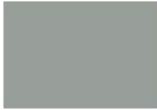
115 Cape Cod Gray