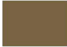
444 Mesquite Brown