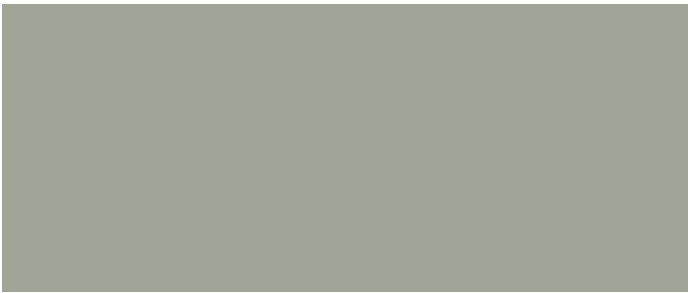
Cape Cod Gray

Standard color selection (Also available in Clear #000)